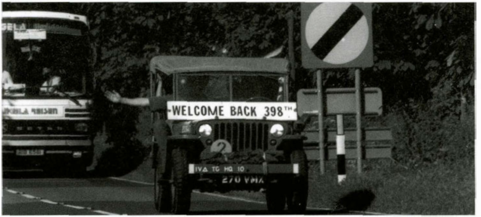
WHEN THE TOUR COACH arrives at Nuthampstead there is always a friendly welcome by the Friends of the 398th and oftentimes a WW II jeep there to escort. Will the "Welcome Back" Jeep be there to greet the Yank visitors next June?

COLOR GUARD troops march past the statue of an 8<sup>th</sup> Air Force aerial gunner at the American Military Cemetery at Madingley, near Cambridge, England. Members of the 398<sup>th</sup> will visit this place on Friday, June 11, as part of the "One LastLook"2004 EnglandTour, scheduled for June 3-15. A floral wreath will be presented in memory of the group's killed and missing in action.